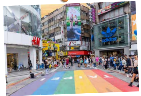
西门町 / Ximending