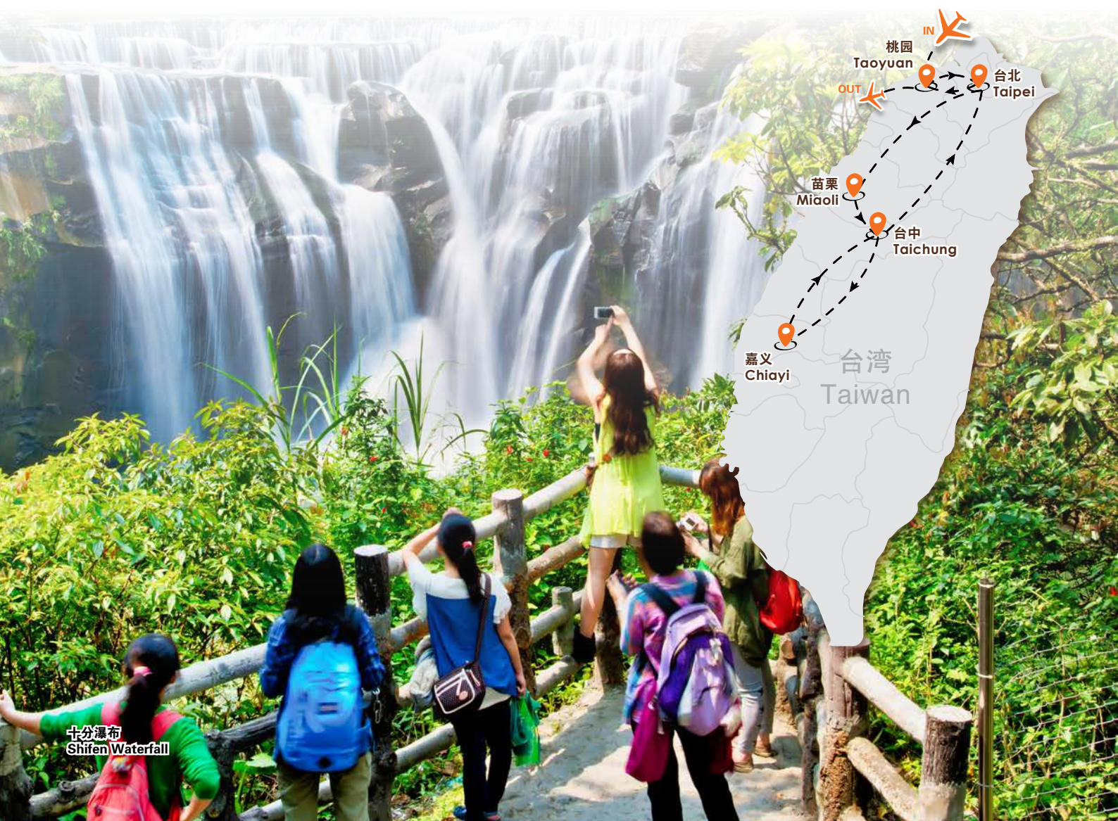
十分瀑布 Shifen Waterfall

※ Sequence of the itinerary is subject to change according to the final flight confirmation.