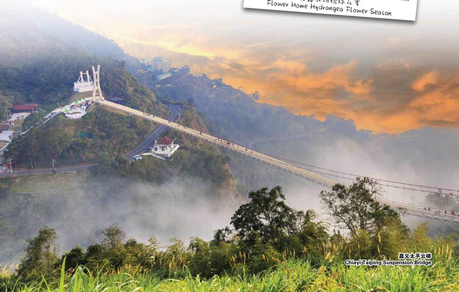
嘉义太平云梯 Chiayi Taiping Suspension Bridge