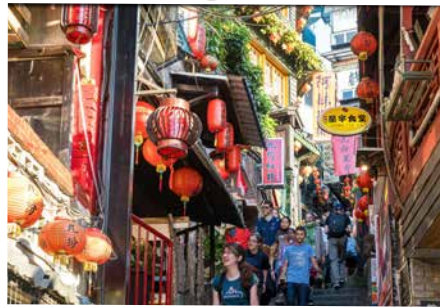
九份 / Jiufen