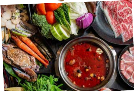
新千叶火锅自助吃到饱 (C餐) Steamboat Buffet