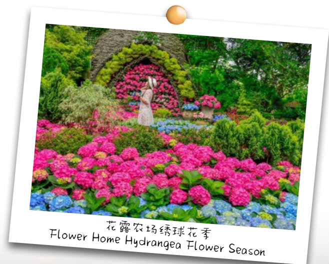
花露农场绣球花季 Flower Home Hydrangea Flower Season